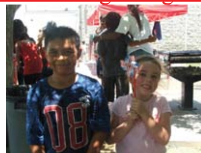
Red, white & blue carnival.