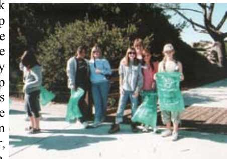
Tail Maidens participate in beach clean-up.

to the observatory. In August, they will be hosting Family Camp at Caspers Wilderness Park in San Juan Capistrano. Activities planned for Family Camp are; family skits, pie eating contest, chili cook-off, and movie night. The children have been busy working on various community service projects; collecting supplies for the Norco Animal Shelter, care packages for our troops serving in the Middle East, and will be having a book drive to celebrate literacy awareness in September.