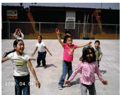
Outdoor fun and games YMCA Home Gardens

Inside our classroom we are growing a herb garden. We will be preparing recipes using our herbs. Our summer also consists of several trips, to the movies, to the park for picnics, and to community museums.