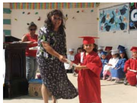
Congratulations! You did it!