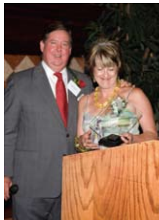
Cynthia Schneider Distinguished Service Award