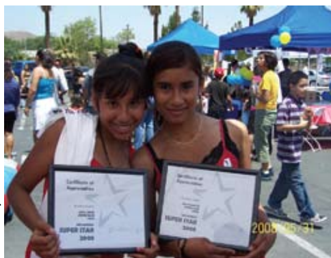
Super Star Certificates of Appreciation

The teens at the Community Center in Home Gardens have been keeping busy with lots of fun activities. They're learning to bake in their cooking class. Every Tuesday they enjoy spelling games and bingo every Wednesday. On July 3rd they took a field trip over to the Main Y to join in on the fun for the Red, White, and Blue carnival. The teens also had a booth at the City of Corona Police Department Code Enforcement's grand opening. The dance class also performed at the grand opening ceremony.