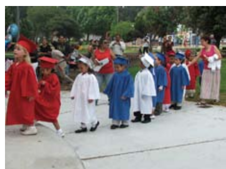
Lining up before the ceremony.

June was a very busy month for both State and General Preschool. We had four graduation ceremonies. This year, we held our ceremonies at Corona City Park. The students were dressed in red, white, and blue cap and gowns. Several of our parents volunteered to make this year's graduation ceremony a huge success. General Pre-school is back in session. Our teachers and staff are working hard to get ready for September when our State Preschool session begins.