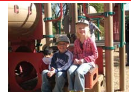
Field Trip to local park.