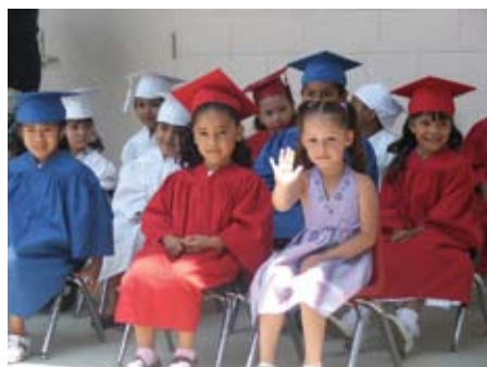
State Pre-school students anxiously waiting.