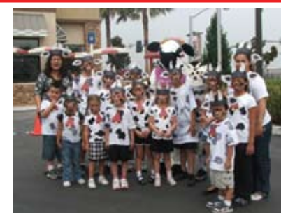
Chick-Fil-a Field Trip