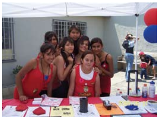
YMCA booth at the Code Enforcement Grand Opening

The teens at the Community Center in Home Gardens have been keeping busy with lots of fun activities. They're learning to bake in their cooking class. Every Tuesday they enjoy spelling games and bingo every Wednesday. On July 3rd they took a field trip over to the Main Y to join in on the fun for the Red, White, and Blue carnival. The teens also had a booth at the City of Corona Police Department Code Enforcement's grand opening. The dance class also performed at the grand opening ceremony.