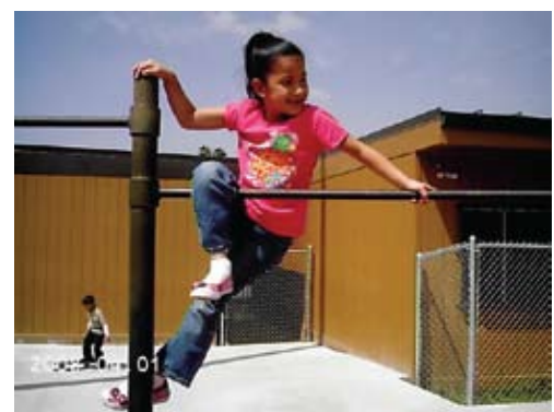
Enjoying outdoor playtime.

The YMCA at Home Gardens has been exploring the summer with the introduction of our new out door equipment. We have been bowling, playing Shuffle Board, Caroms, and basketball, to name a few. We are looking forward to learning to run hurdles and play yard hockey.